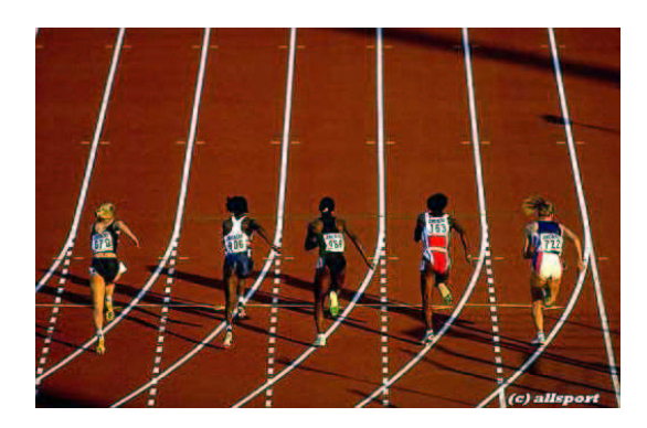
... and now to something completely different

If you have more time you can have a look at the program para_demo.py available on the computer and in Section 6 which demonstrates how to run Python programs in parallel using message passing - a paradigm where processors communicate by explicitly sending and receiving data to and from each other. The Python module pypar developed here at the ANU implements message passing parallelism for Python.